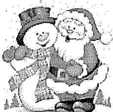
Christmas joy warms the heart

MDGP and BRHS will be closed over the Christmas period from close of business 18 December 2009 and will reopen 4 January 2010, making this as the last Friday Fax for the year. We wish you all an enjoyable and safe break as we prepare for another eventful year in 2010.