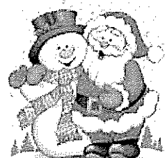
Christmas joy warms the heart